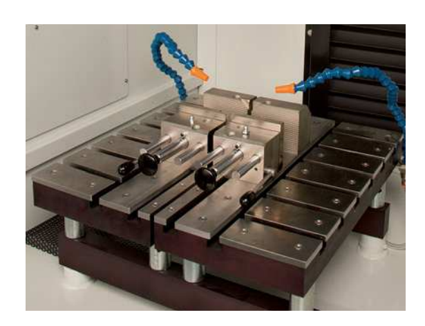
A spacious cutting chamber: W 408 x D 422 mm with openings on both right and left sides for the cutting of long samples.